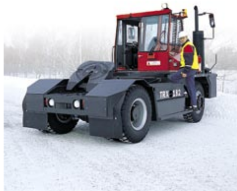
Top-level safety with ROPS approved cabin, excellent all around visibility, easy access to rear deck through rear door and wide, clear stairways on both sides of chassis.