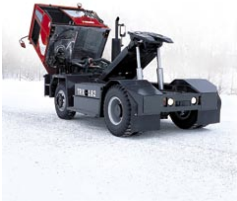
60° tiltable cabin gives excellent access to engine and transmission.